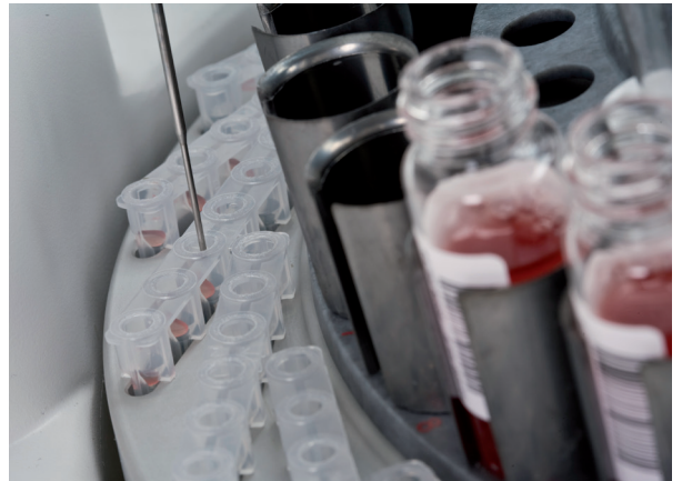
Pipetting of ID-Cards

This enables you to customize your laboratory according to your current and future requirements.